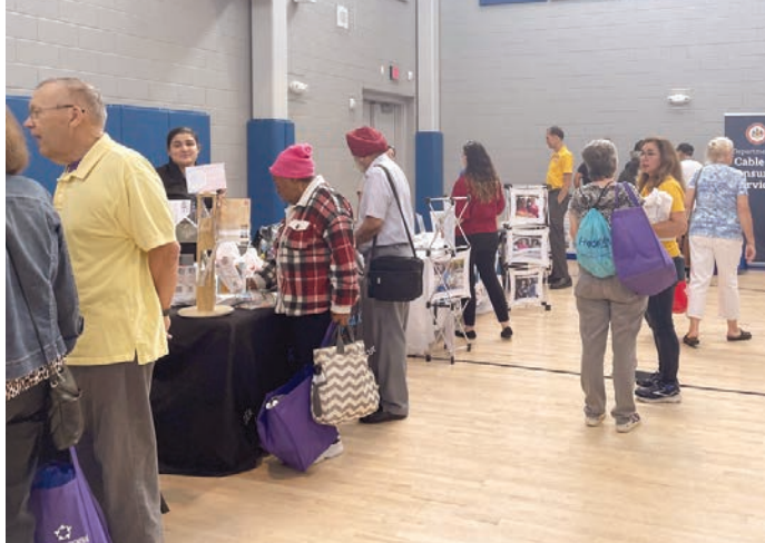
The exhibit hall at the Senior Safety Summit featured over 30 County agencies and local organizations.