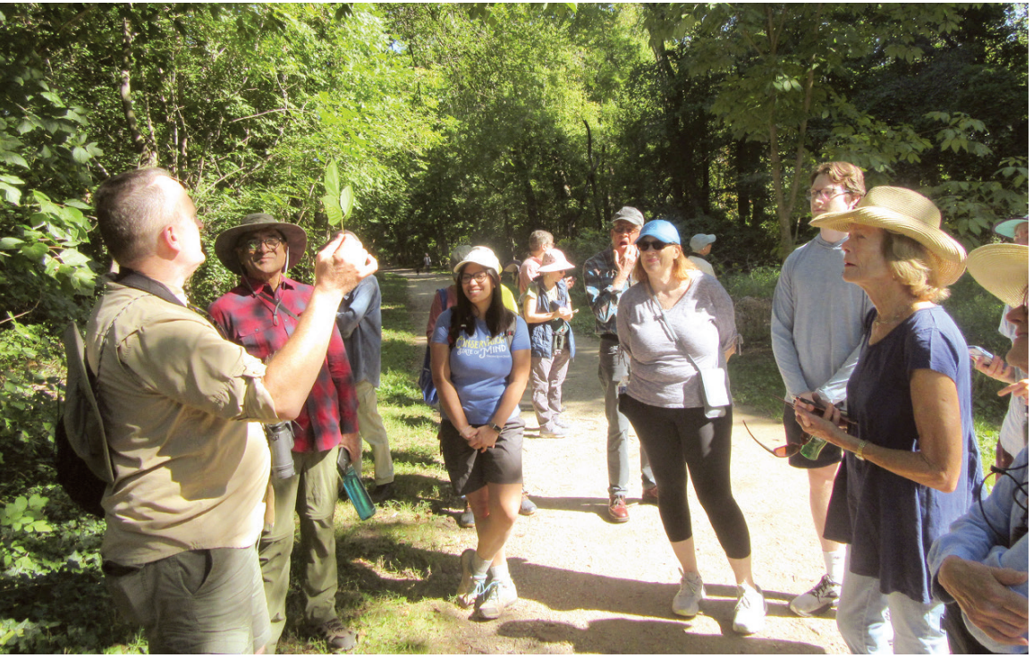
Thirty-five people on two separate walks at Dyke Marsh had multiple ecology les-

"Plants tell you where you are, the hydrology of the system," said