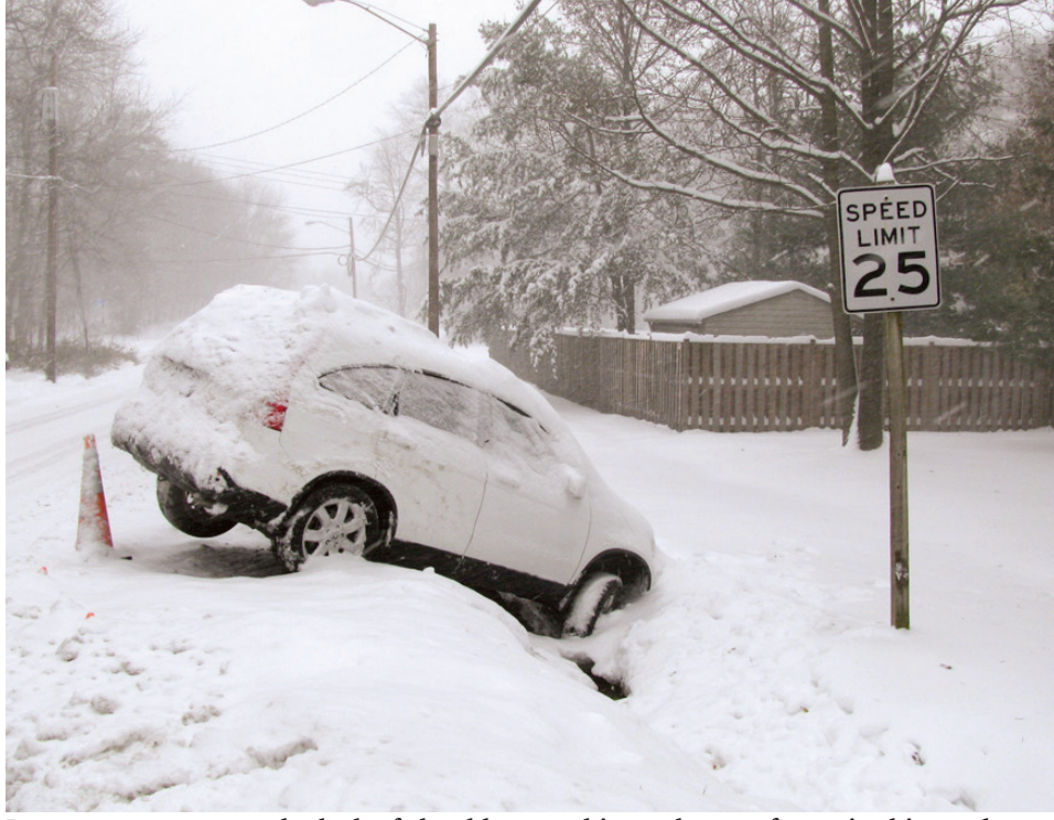
In a past snowstorm, the lack of shoulders on this road was a factor in this crash.

A traffic count by the Virginia Department of Transportation in 2020 showed that 5,000 cars a day use this road, mainly as a cutthrough to I-95 and 400 trucks a day use it too, despite the "no trucks" designation of the