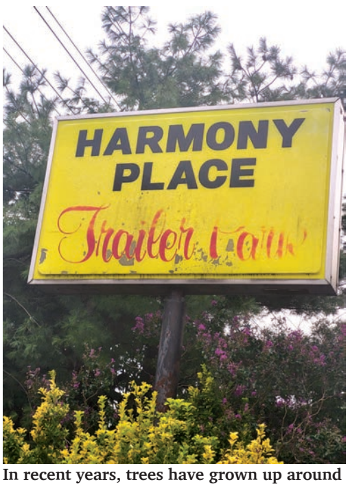
This sign has been on the job since the 1980s.

Many businesses use neon signs to bring in more attention, particularly after dark. They are full of the nostalgia factor that attracts many. According to Neon Creations sign company, neon signs were developed by French engineer Georges Claude in 1902, and patented by 1910. He started experimenting and found that when he added different elements to the tube created different colors. The first ever neon light was two neon-tube lamps created by Claude in Paris in 1910, www.ConnectionNewspapers.com