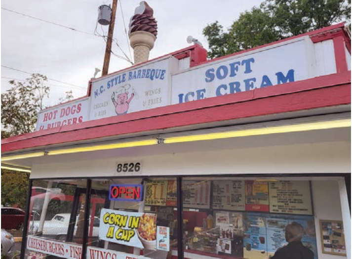
The plastic snow cone screams nostalgia at this barbecue drive-in.

ple are beginning to see it as an art form, Neon Creations said. Actual neon has been pushed aside though in the name of going green. "The trend for signs is LED signs," Hick-