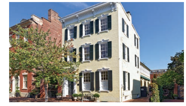
Old Town | $2,950,000

Spectacular 19th century home exemplifies the beauty of its era featuring original floors & doors, high ceilings, 2 wood-burning fireplaces, eat-in kitchen, and sunroom. Private brick patio surrounded by mature landscaping and one off-street parking space. 411 Prince Street Babs Beckwith 703.627.5421 www.BabsBeckwith.com