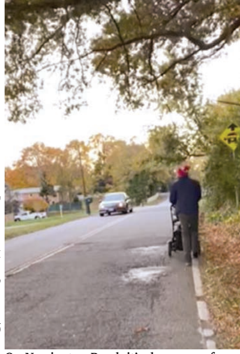
On Newington Road, it's dangerous for pedestrians to walk.

Storck supports the idea but noted that funding is an issue, as it is with many of the transportation improvements that are needed in the county. "Securing funding will likely remain our biggest challenge due to the limited dollars and the high number of needs," wrote Storck in responding to Lyon, dated July 21, 2023. "To be sure,