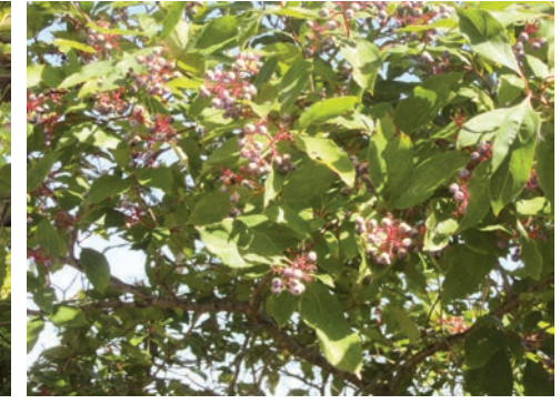
Doghobble has beautiful berries this time of year. WWW.CONNECTIONNEWSPAPERS.COM