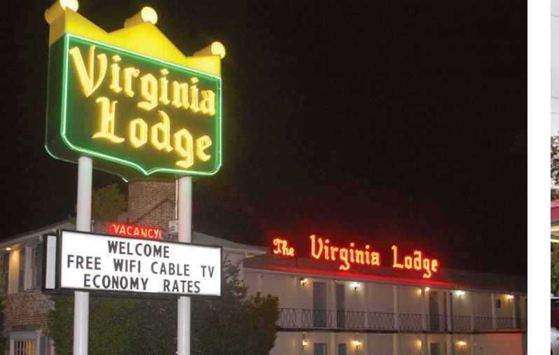
This neon sign is a familiar site in Mount Vernon.

Believe it or not, there are sign museums across the country: MUSEUM OF NEON ART (MONA): www.neonmona.org (Glendale, CA)