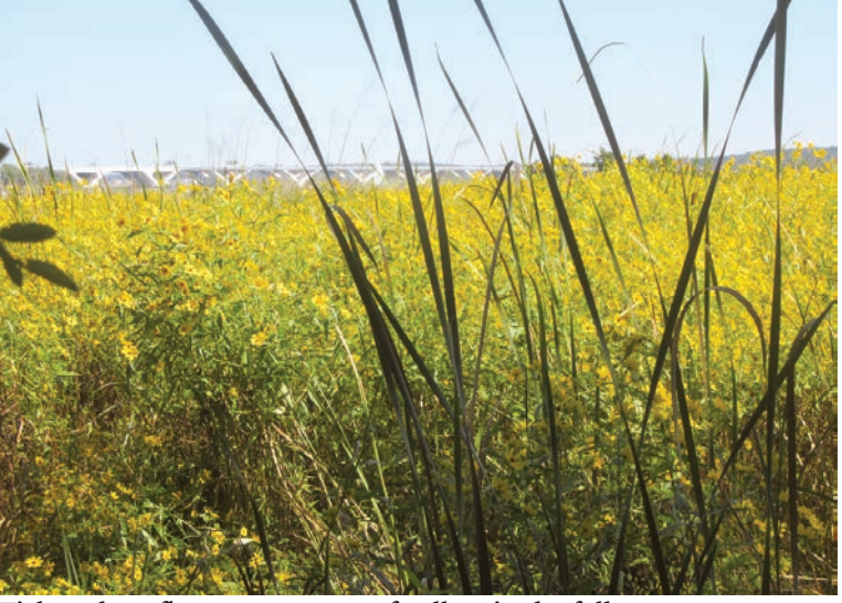
Tickseed sunflowers are a sea of yellow in the fall.