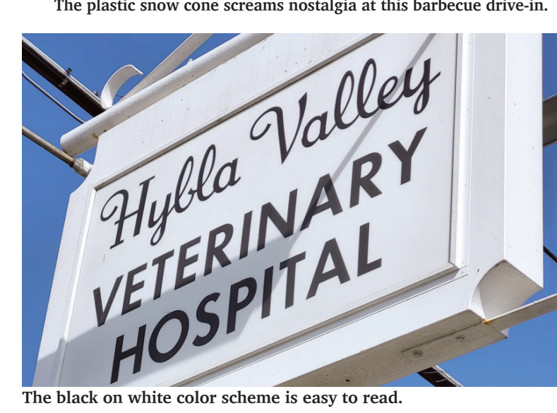
The black on white color scheme is easy to read.

ey said, "it still looks like it's neon." The Domino's sign in Baltimore did go LED in recent years.